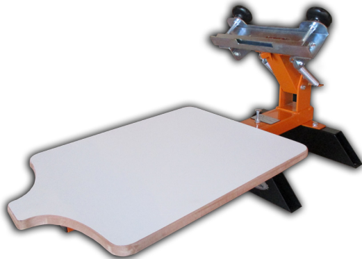
JR.1 JUNIOR -1 PRINTER