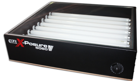
JR. X-Posure 5060