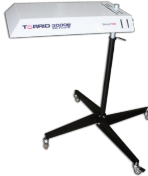
TORRID-3000 IRC Flash